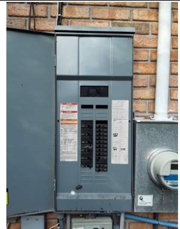
Square D-150 amps